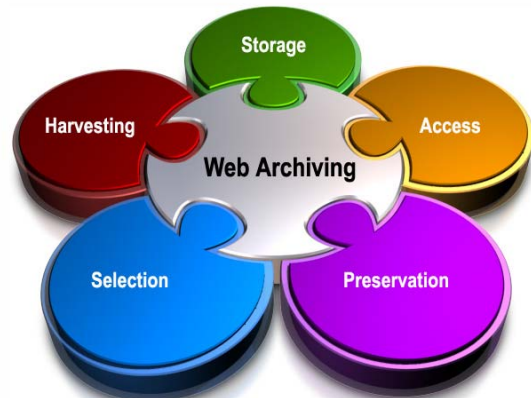
Figure 2. Key processes of web archiving

Regardless of the approach, there is a set of processes essential to web archiving which need to be performed and managed to ensure fitness for purpose of any web archiving system. This framework may be a simplification but it provides a high-level overview of the wide range of complex tasks the archiving organisations have to perform. In addition, it helps us to critique or analyse later in the paper the current practices related to these processes.